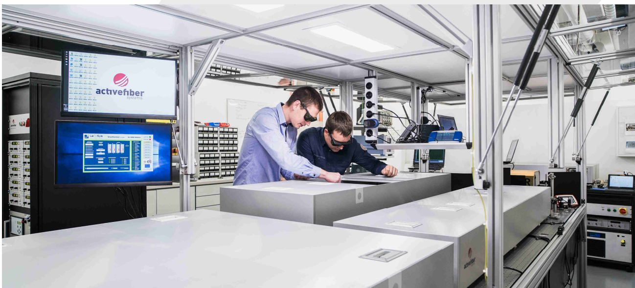
High-pulse energy laser with nonlinear-compression add-on