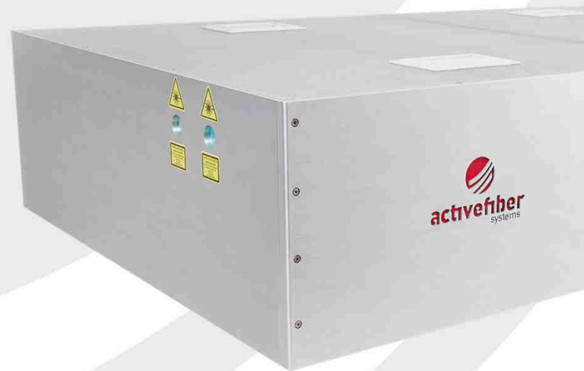
kW-class high-repetition-rate fiber laser